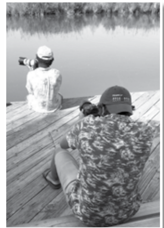
Students help JPixx pros shoot the new Eastern Branch film for RIVERFest.