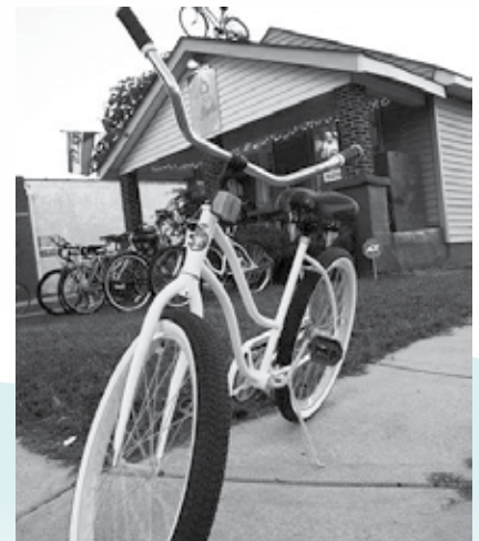
Hund’s ReCycle Factory in Norfolk is donating a hand-built, recycled bike to a lucky River Star Home at RIVERFest.

Chance to win a gift certificate to A.W. Shucks when you register ahead: ElizabethRIVERFest.org .