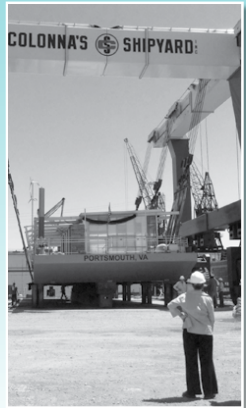
Our Learning Barge heads back in the water thanks to Colonna's. The shipyard and other maritime partners say they're inspired to take care of the barge by the children she reaches, such as Norfolk fourth graders (below).

Thanks, Rotary Clubs of Norfolk, Portsmouth & District 7600 for new grants for river education!