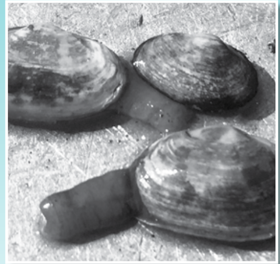
These soft-shell clams mean our clean up has succeeded in bringing back healthy life at Money Point, thanks to you!

Thanks to the supporters like you, cancer rates in the mummichog indicator fish have dropped to background levels at Money Point. Old Dominion University also has found the “bamboo worm” at Money Point, another indicator of healthy habitat. Elizabeth River Project and the Living River Restoration Trust are completing design for the final phase of cleaning up Money Point, in partnership with Virginia Port Authority and Hess Corp.