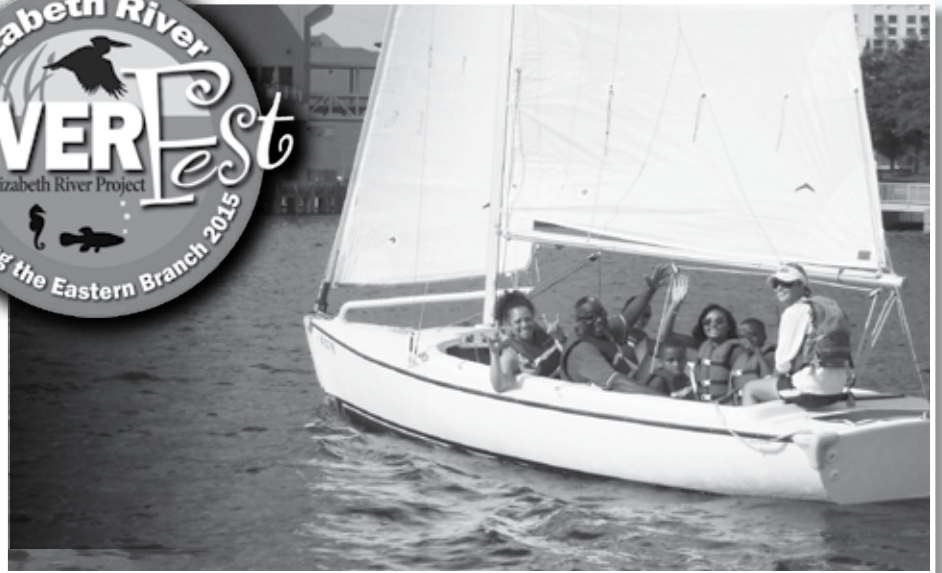
Free rides with Sail Nauticus are part of the new, expanded RIVERFest.

Saturday, Sept. 12, 10 am -5 pm Free All Day, Nauticus Waterfront