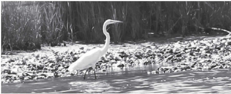
It’s low tide at a new oyster reef on the Lafayette. The reefs provide habitat for much more than oysters.

Counting three we built earlier, we’ve now added 7 oyster reefs totaling 5.2 acres to the Lafayette! Partner Chesapeake Bay Foundation seeds the reefs with young oysters - more than 13 million so far. Learn more at the Oyster Oasis, new at RIVERFest 2015.