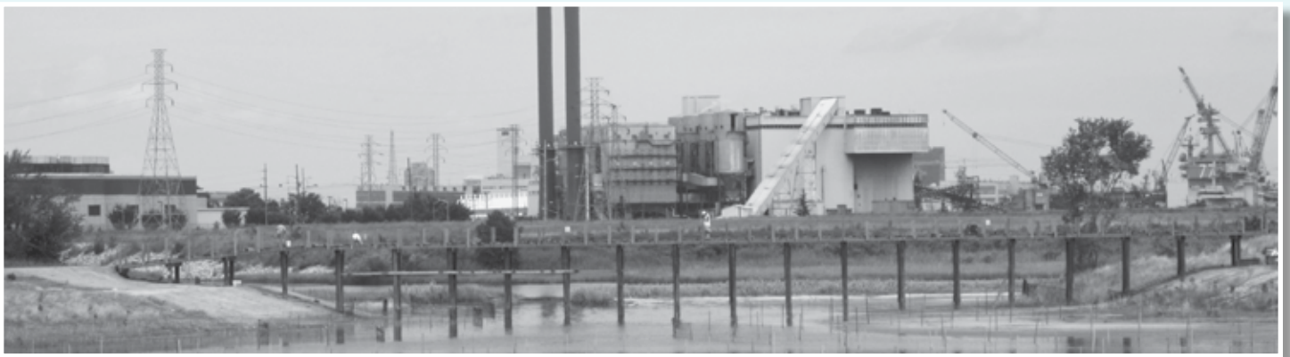
Thanks for way less pollution – Wheelabrator Portsmouth won Inside Business River Star Hall of Fame 2015 for mega pollution reductions with Elizabeth River Project. Here’s Wheelabrator seen from our Paradise Creek Nature Park during construction of the park’s wetlands and footbridge.

Continued from page 1 - Also new this year: A “Living River Art Show” with a prize for the best art depicting Elizabeth River Project’s new focus area, the Eastern Branch. A professional video about the Eastern Branch, for which high school students were allowed to help shoot footage.