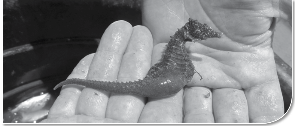
This seahorse was captured in the Lafayette in July - just one of the signs of the historic comeback of this branch of the Elizabeth, thanks to your support.

Seahorses, Cleaner Water Part of a Great Year