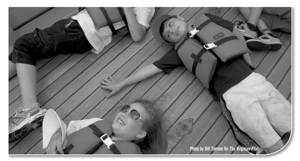
Sailing the Schooner Virginia meant time to enjoy the river. The schooner and barge were joint hosts.

The week was packed, with visits aboard five different kinds of river vessels, learning to play sea shanties on the harmonica, tying nautical knots,