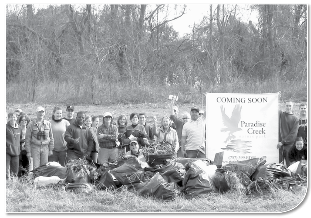
Volunteers spent the morning removing decades of litter along the Victory Boulevard frontage of the park. Forty acres of forest and wetlands will showcase restoration. (February 2012).

Once this corner of the Elizabeth River did look like Paradise. Thus the name from the 1800s, "Paradise Creek," on "Paradise Plantation."