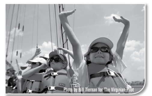
A new summer camp introduced children to five river vessels with extra time to explore the river.