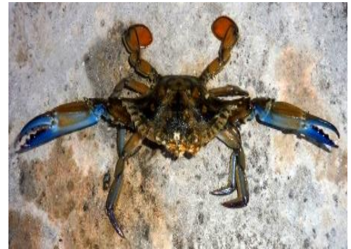
Blue Crab, Callinectes sapidus , translated from Latin means “beautiful savory swimmer.”

Students learn how the Elizabeth River gets its brackish water and why salinity is important for blue crab behavior. They test the salinity at the barge site to decide whether they are more likely to find adult crabs or juvenile crabs. Students observe live blue crabs and learn how they swim, eat and even regenerate appendages.