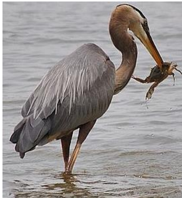
Heron eating blue crab.