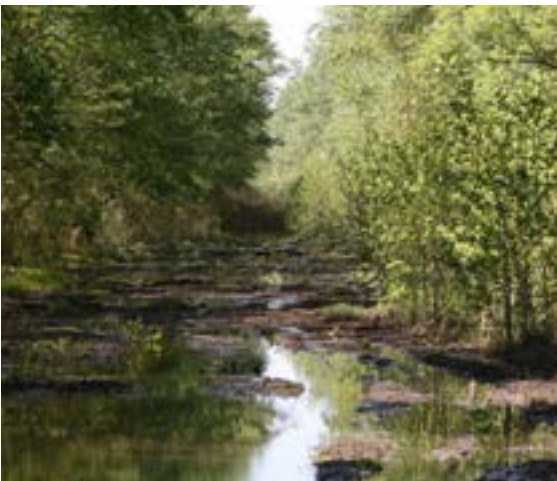
Part of 500 acres added to the Great Dismal Swamp Refuge.

While the rest of the environmental movement chafed at home this Earth Day, our sister non-profit, the Living River Trust, celebrated something huge: The transfer of 500 acres of forest to the Great Dismal Swamp Wildlife Refuge, to be protected forever.