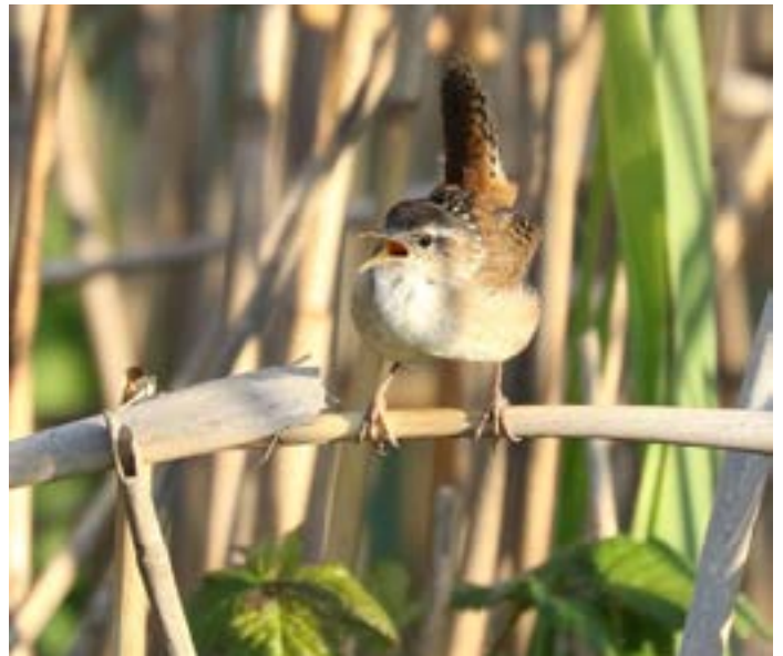
"Singing male marsh wren at the Money Point restoration site" - Dave Gibson