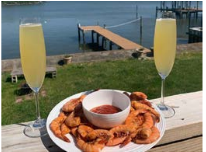
"Easter Brunch cannot be stopped by quarantine." #LoveLiz - brunchinbrad