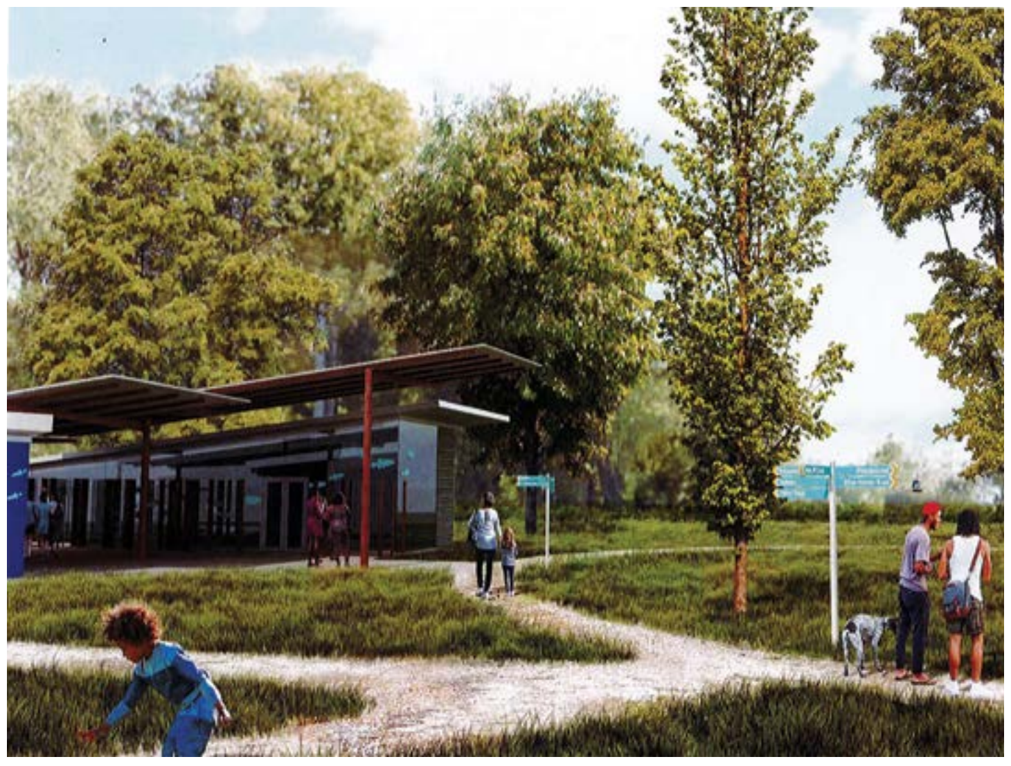
Special thanks to Dills Architects of Virginia Beach for donating this design for expanding our Beazley River Academy in Portsmouth.