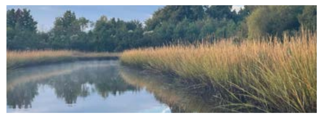
Lush and beautiful now, the wetlands at Paradise Creek Nature Park are relatively new. Virginia Port Authority, helping us create the park, dug out old fill and planted the marsh in 2012.

P.S. Please consider returning a special gift with the enclosed card or give online at elizabethriver.org.