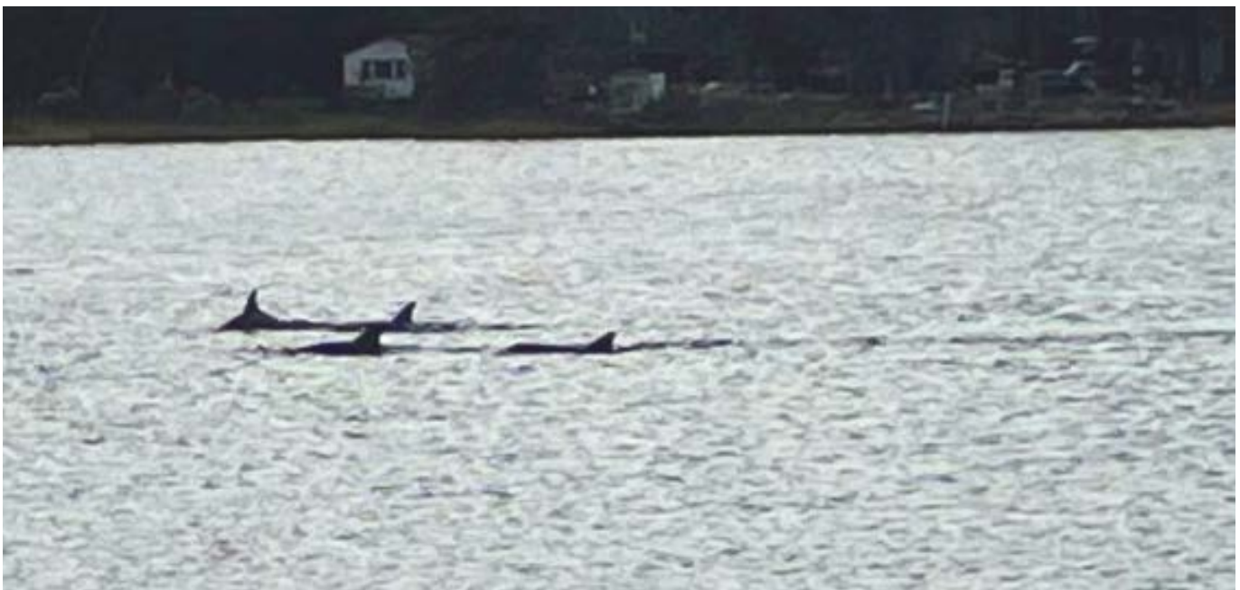
A pod of dolphins passes by our Dominion Energy Learning Barge, on the Eastern Branch of the river on Nov. 9. Education staff took a quick video, advising the rest of us to "mute if you don't want to hear our gasps!"