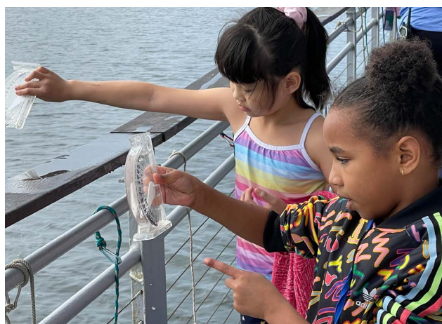
Taylor Elementary third graders aboard our Learning Barge - spider crabs are exciting but a little scary (left). Hydrometers help students measure river salinity (middle and right).