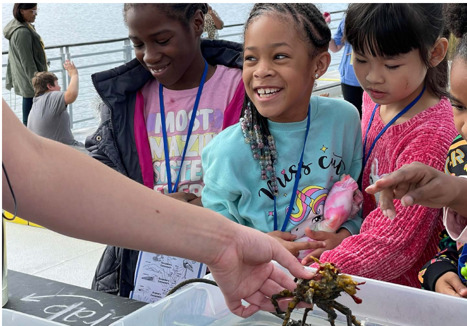
Taylor third-graders meet a spider crab at one of the barge's six learning stations.