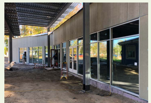
Walls, windows and a covered pavilion are up for the new wing of our River Academy in Portsmouth, thanks to you.