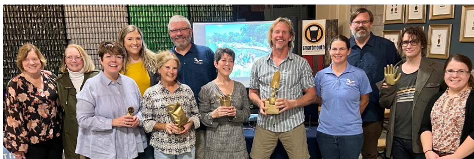
Volunteers of the year hold awards, surrounded by staff and board, Nov. 12 at our first volunteer recognition event.

“I love the Elizabeth River. I’m on and around it all the time on my bike, in