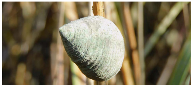
Students meet marsh periwinkles aboard the barge.