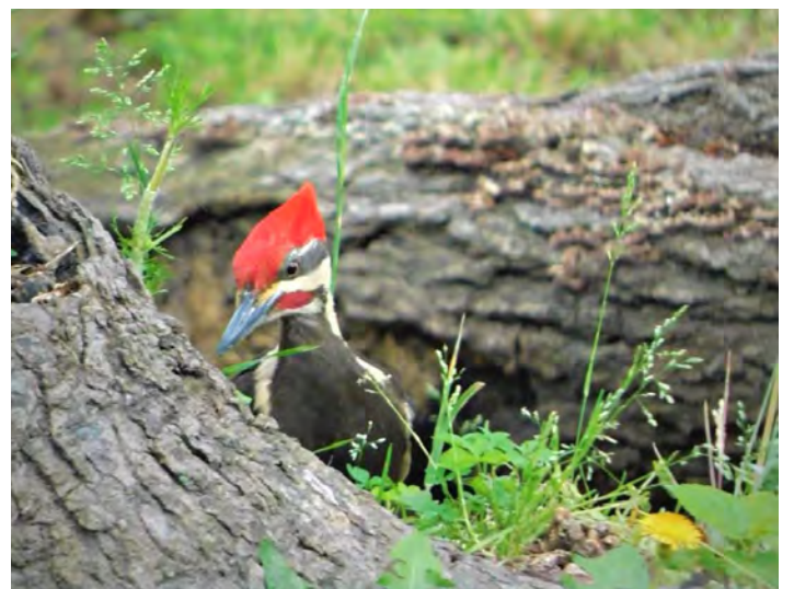
An Indigo Bunting (left) perches outside our expanded River Academy at Paradise Creek Nature Park. Note the “anti-bird strike” dots on the window to keep birds from flying into the glass (a top cause of songbird death). Meanwhile a Pileated Woodpecker (right) explores the park woodlands. Your membership makes possible ongoing revitalization of habitat throughout the 40-acre park – thank you.