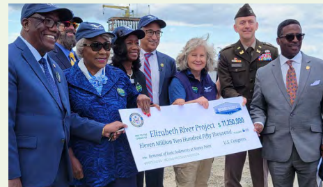
State, local and federal officials celebrate $11.25 allocated by Congress to clean up “Money Point III.”

“The goo must go!” agreed state and local legislators, repeating our rallying cry for cleaning up the river bottom. Next, the state will need to budget $3.75 million to meet the Corps’ requirement for matching funds.