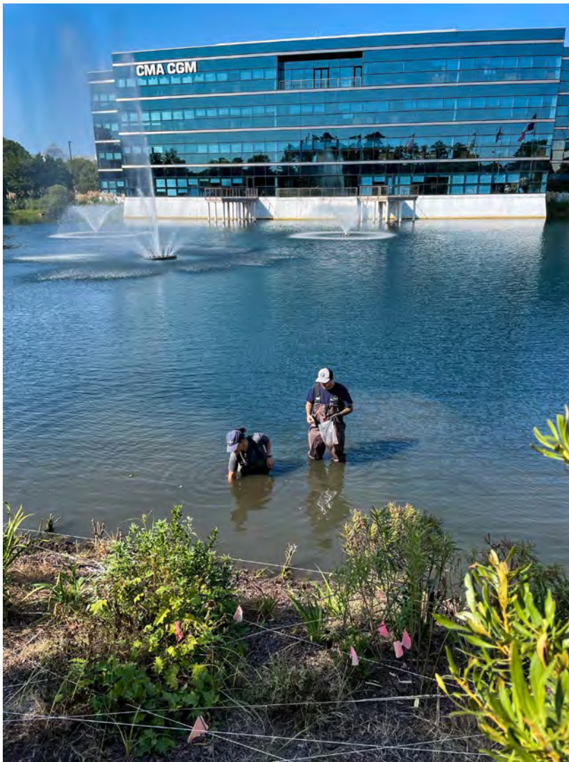
CMA CGM installs aquatic plants in a stormwater pond at its North American HQ.