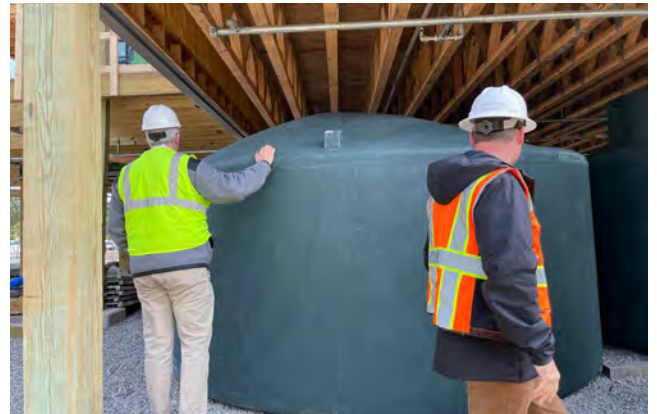
Two giant cisterns, 5,000 gallons each, will save rain water for re-use to flush the Ryan Lab toilets. Here, architects observe them on the tour.