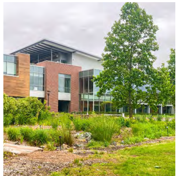
Native gardens surround Virginia Wesleyan's Greer Environmental Sciences Center