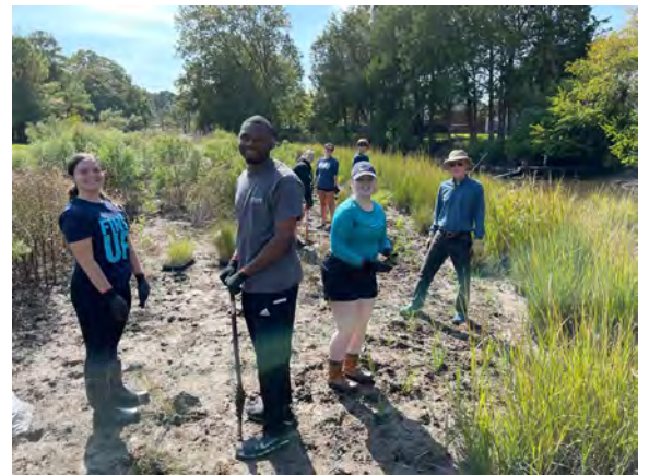
Virginia Wesleyan students plant a wetland, helping earn Inside Business River Star Hall of Fame