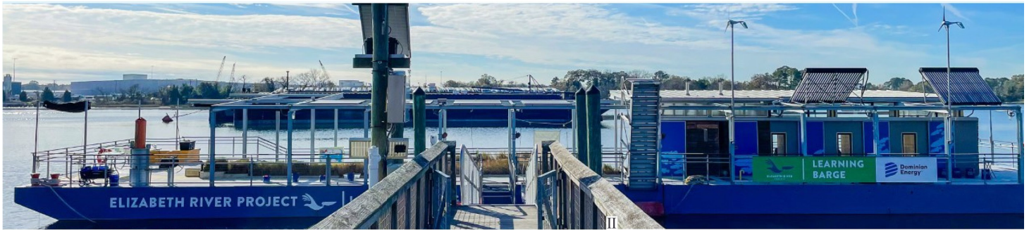
The Elizabeth River Project's Dominion Energy Learning Barge docked at Grandy Village Learning Center in Norfolk, Virginia.

To increase environmental literacy, the Elizabeth River Project provides a menu of award winning programs to inspire yearlong Meaningful Watershed Educational Experiences for prek-12th grade teachers and students. Our programs reflect the Virginia Standards of Learning and our commitment to diversity, equity, and inclusion. Contact us for current program pricing and possible funding assistance.