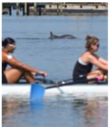
Dolphins (like the one above), otters, seahorses and more are now common in the Elizabeth - thank you members!