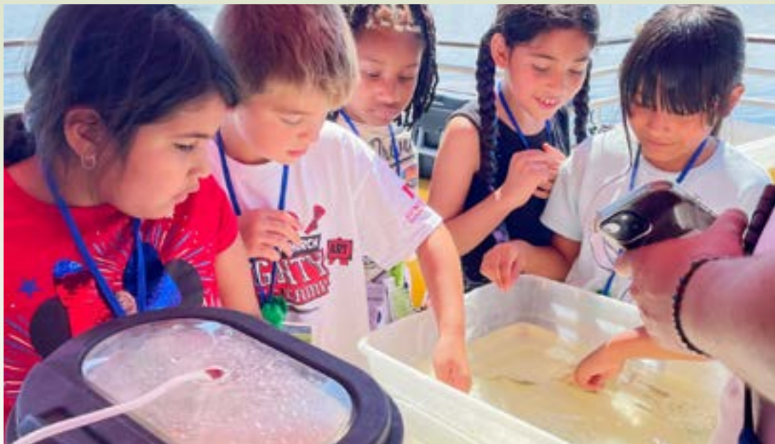
Students meet river life, often for the first time, on the Elizabeth River Project's Dominion Energy Learning Barge.

“Our wild idea seemed like an impossible experiment, but we made it happen” says