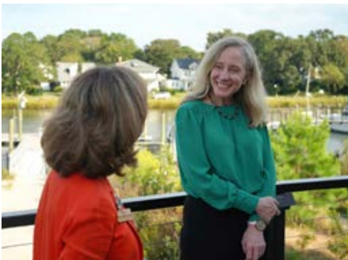
Governor-elect Abigail Spanberger visits the Ryan Resilience Lab to learn about sea level rise challenges and innovative resilience strategies shaping Coastal Virginia's future.