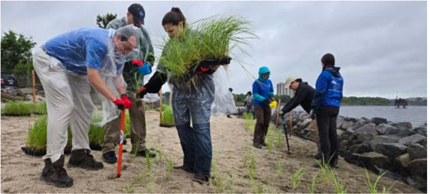
Soaked by rain but undeterred, Buckeye Partners volunteers planted over 15,000 marsh grasses—transforming a hardened shoreline into a thriving wetland along the Southern Branch of the Elizabeth River.