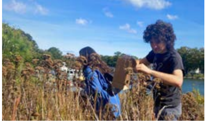
Volunteers spend the fall harvesting seeds to restock the Ryan Resilience Lab's popular Native Seed Library, helping meet growing community demand for native plants.