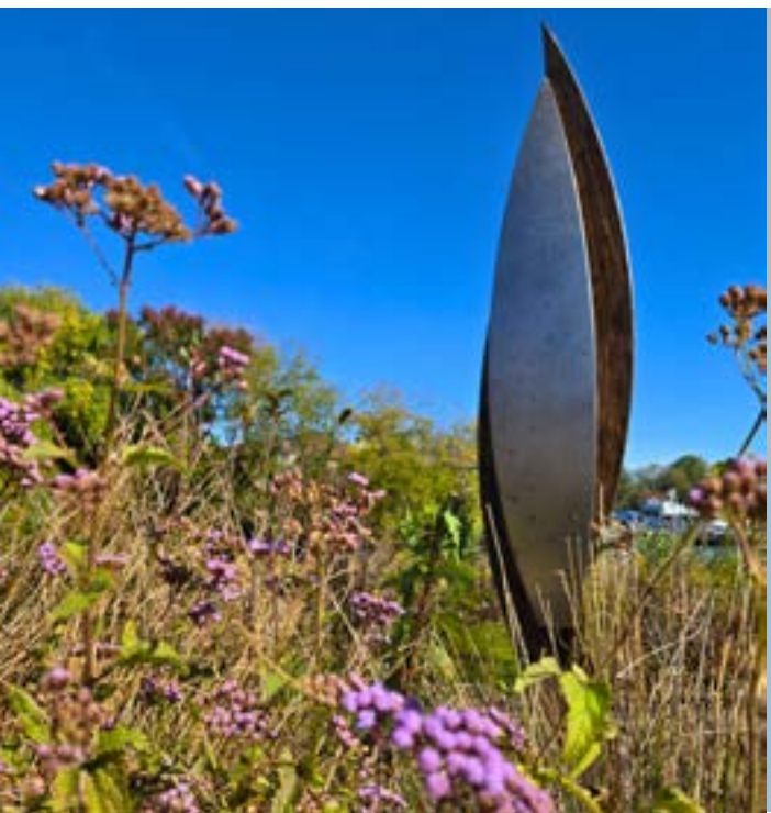
Tidal Rhythms stands as a sculptural sentinel at the Ryan Resilience Lab—translating nearly a century of tidal data into a powerful marker for the future, where rising seas will one day signal the site's return to nature.

The sculpture's surface is also designed to evolve with the landscape. As tides rise, the