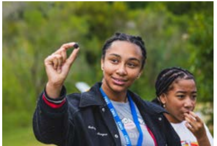
Youth from ForKids pause to pick blackberries at Paradise Creek Nature Park, connecting with nature through our edible park initiative—an effort to help address food insecurity in a community located within a food desert.