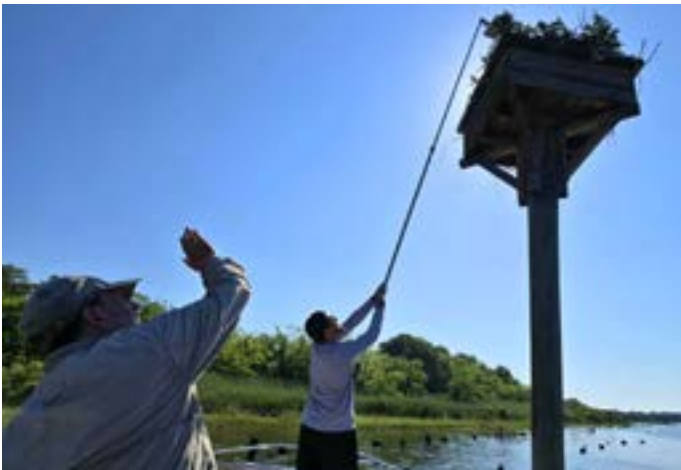
Elizabeth River Project staff team up with the Center for Conservation Biology as part of a Chesapeake Bay-wide osprey survey, revealing troubling results: osprey pairs on the Elizabeth River produce only 0.53 young per nest—well below the 0.8 threshold needed for a stable population.