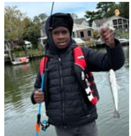
Species caught during the catch-and-release fishing included speckled trout—and even an American eel.

Thanks to your support, Hooked & Hooped continues to grow as a bridge—linking young people to nature, community, and a future they can help shape.