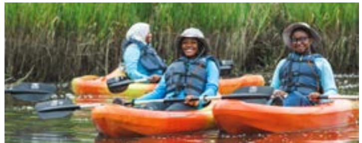
Interns explore the river's wetlands by kayak, gaining a close-up view of the ecosystem they're learning to protect.