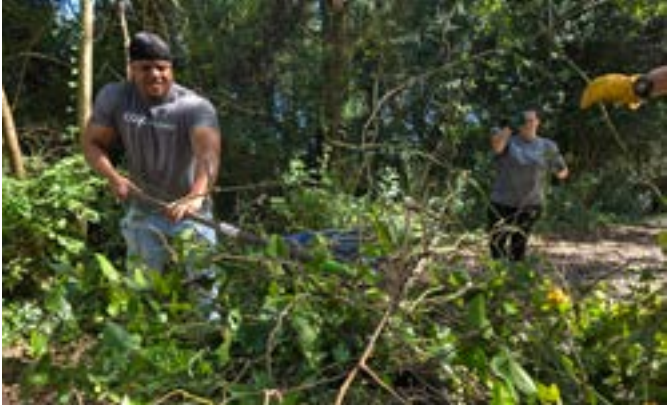
River Star Business Cox Communications team members lend a hand at Paradise Creek Nature Park, mulching native trees and removing invasive plants to support a thriving habitat.